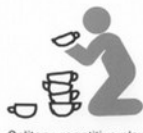
Solitary repetitive play

Social behaviour is often naive and peculiar. Can tend to become intensely attached to particular possessions often engaging in repetitive activities. Resistant to change, coping best when life is predictable. They prefer structure and may concentrate exclusively on matters in which they are interested. Are often known as loners who never quite fit in because of eccentric behaviour, peculiar ways of speaking and a lack of social skills.