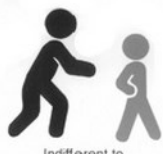
Indifferent to physical contact

There tends to be impairment in two way social interaction due to an inability to understand the rules governing social behaviour. A lack of empathy with others and little or no eye contact may be evident. Can appear to be stuck at the egocentric stage of social and emotional development. They tend to perceive the world exclusively from their own point of view. Although interested in social relationships often social contact is made inappropriately.