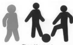
The odd one out