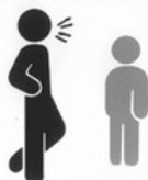
Poor conversation skills