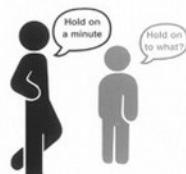
Concrete pedantic interpretation of language

Although these children are often highly articulate, content of speech may be abnormal, tending to be pedantic and often centering on one or two favourite topics. Sometimes a word or phrase is repeated over and over in stereotyped fashion. Usually, there is a comprehension deficit despite apparent superior verbal skills. Non verbal communication, both expressive and receptive is often impaired.