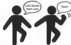
Often teased and bullied by other children