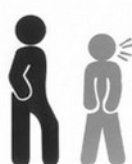
Rarely makes eye contact