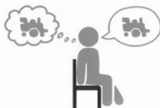
Talks incessantly about one topic